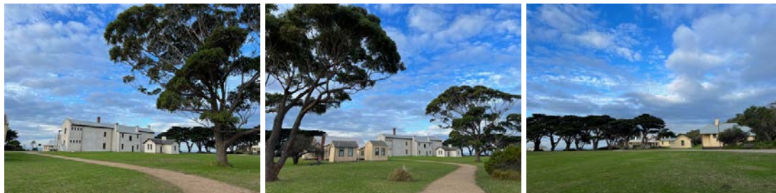
PNNP glorious May afternoon on 1 May 2023.

Updates: 1 May 2023 4.00-7.00pm Point Nepean Advisory Group meeting (first meeting since Nov 2022), Admin centre, former Quarantine Station