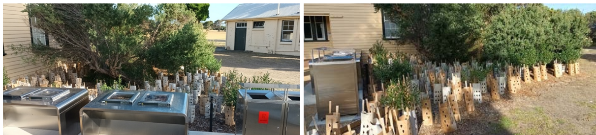
Images of plantings at PNNP camping sites. Photos thanks to: Gidja Walker May 2023

Camping at PNNP was extended until the end of Autumn 2023. Located within the historic Quarantine Station precinct, the pre pitched Discovery Tents offer a unique opportunity to camp under canvas within Point Nepean National Park. The standing-height tents are fixed to timber platforms and include basic camp furniture. The campground area features two and four person sites, as well as accessible amenities including hot showers, toilets, and a fully equipped camp kitchen with an outdoor dining area and BBQs. Following feedback and review of the offering, plans are in place to open up stage two of Camping at PNNP by the end of 2023/early 2023. Refer to Parks Victoria website: https://www.parkstay.vic.gov.au/book-your-stay/point-nepean-discovery-tents