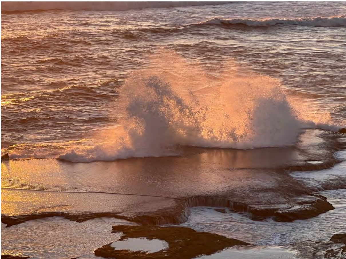
Sunset splash, Bass Strait, Mornington Peninsula National Park, March 2026.