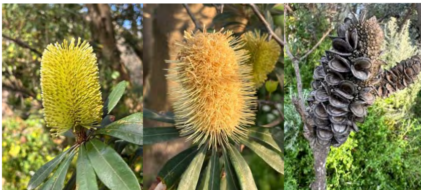
Beautiful Coastal Banksias in Autumn 2026, Blairgowrie.

Thank you for the opportunity to review and respond to the MPS Let's Build a Climate-Resilient Future survey . Please contact the NCG if you have further questions or seek clarifications. We would be happy to discuss.