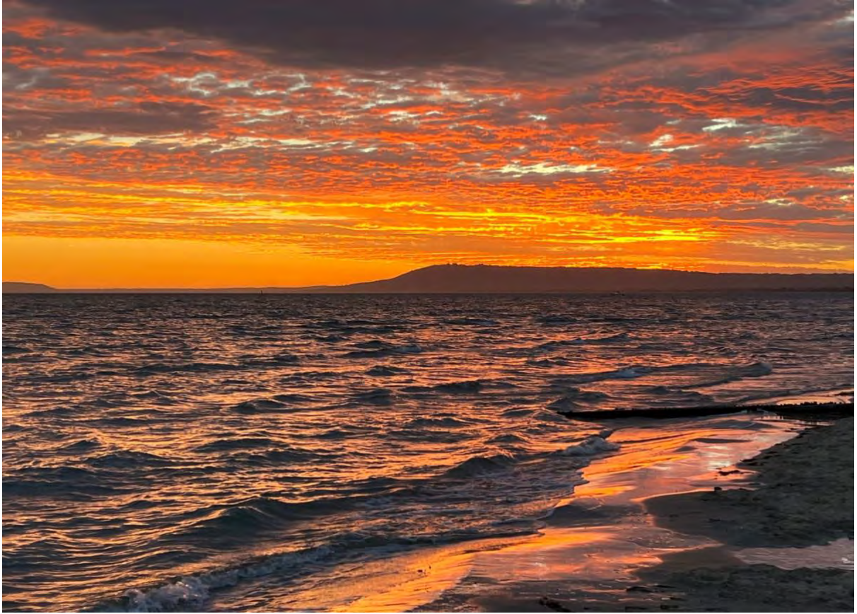
Sunrise captured at Blairgowrie Foreshore, Arthur's Seat in the distance, 11 March 2026; sunrise at Sorrento back beach, below March 2026, a "Monet" composition!