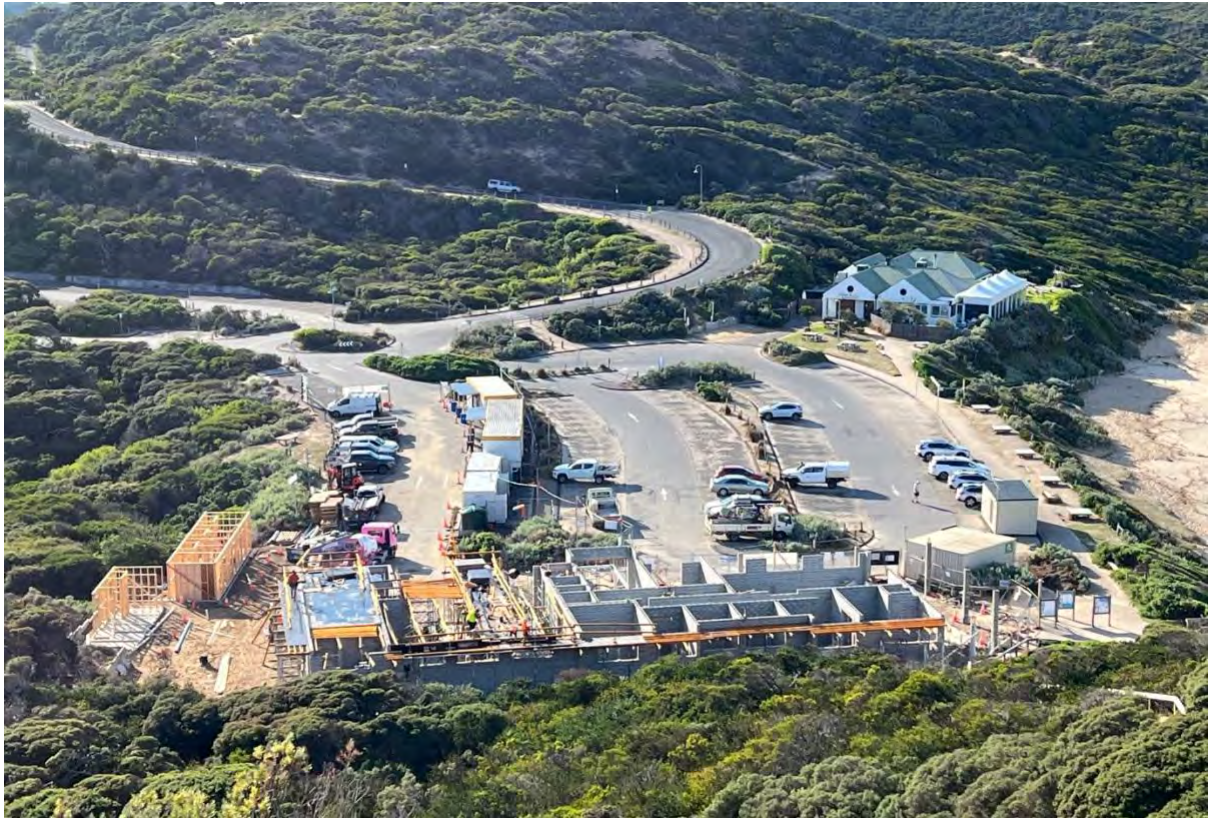
Sorrento Surf Life Saving Club building continues apace, late March 2026.