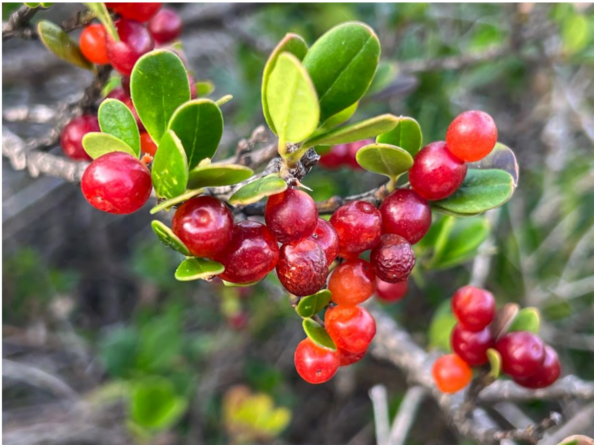
Seabox berries, Mornington Peninsula National Park. Photographed after a rain, late March 2026. Ursula de Jong

Welcome to your NCG Autumn 2026 Newsheet. We do welcome your feedback and engagement. Please note invitations to four events coming up end April and early May 2026.